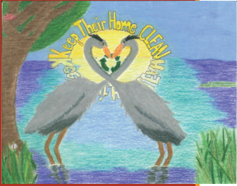
Winning artwork from previous KCB Calendar Contest

Each year art students from around Collier County create artwork based on the themes “Florida—Love It or Lose It” or “Recycling”. The winners of this competition have their artwork featured in a calendar published by Collier County Solid Waste Management Department. The artwork goes through